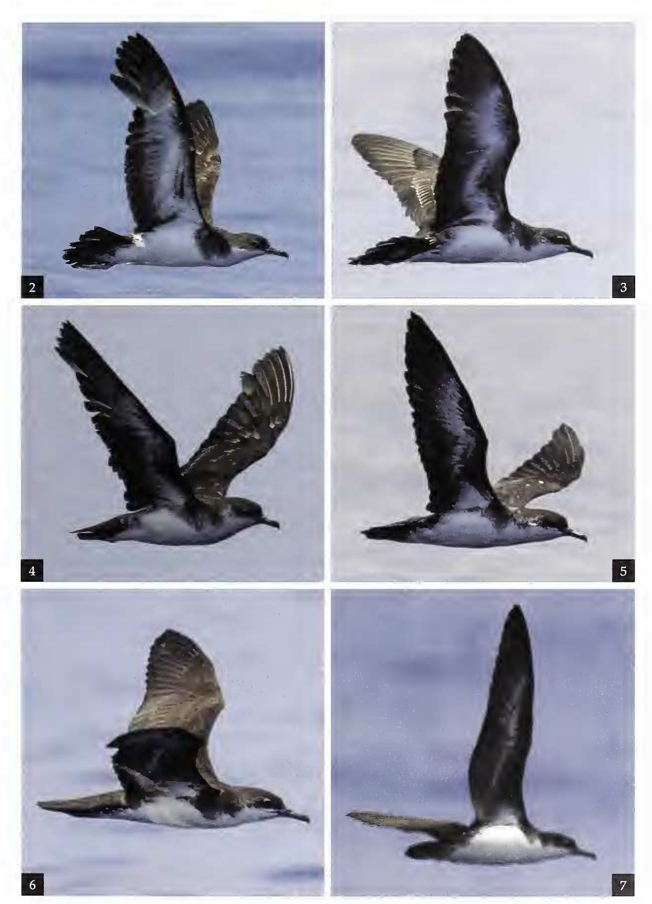
Figures 2–7. Mohéli Shearwater Puffinus ( persicus ) temptator , off Mohéli, Comoros, November 2014, showing variation in darkness of underwing-coverts, as scored in this study (see Table 1); the upper- and middle-left (Figs. 2 and 4) and middle-right birds (Fig. 5) are adults during post-nuptial moult of the remiges, while the rest are juveniles